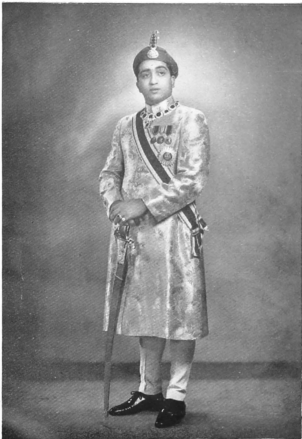
His Highness Maharaja Sir Pratapsinh Gaekwad, Sena-khas-khel Samsher Bahadur, G.C.I.E., LL.D., Farzande-Khas-E-Daulate Englishia